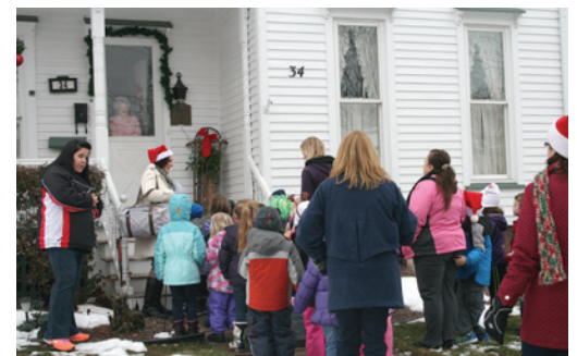
A group of kindergartners serenades a resident of Holley